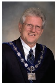
Town of Richmond Hill